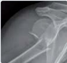
Two-part fracture (AO 11-A2)